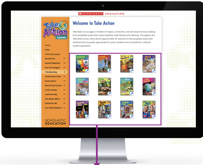
12 magazine-style digital books (32 pages each)

Student HUB includes digital student books and anchor videos. Additional resources also included.