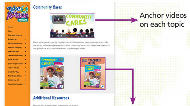
Anchor videos on each topic