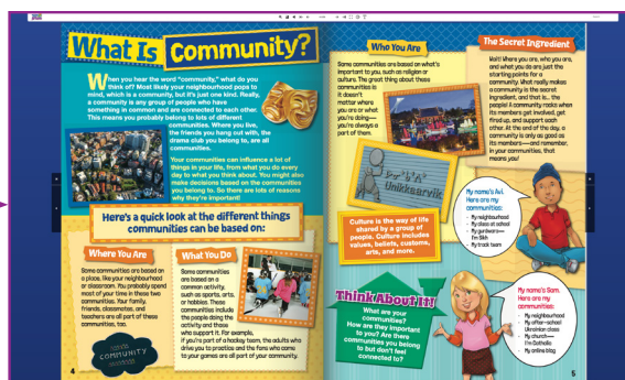
Digital Student Guide

Available in Print or Digital-Only Subscriptions! Contact us for more information.