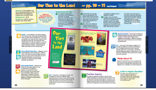
Companion Digital Teacher's Guide