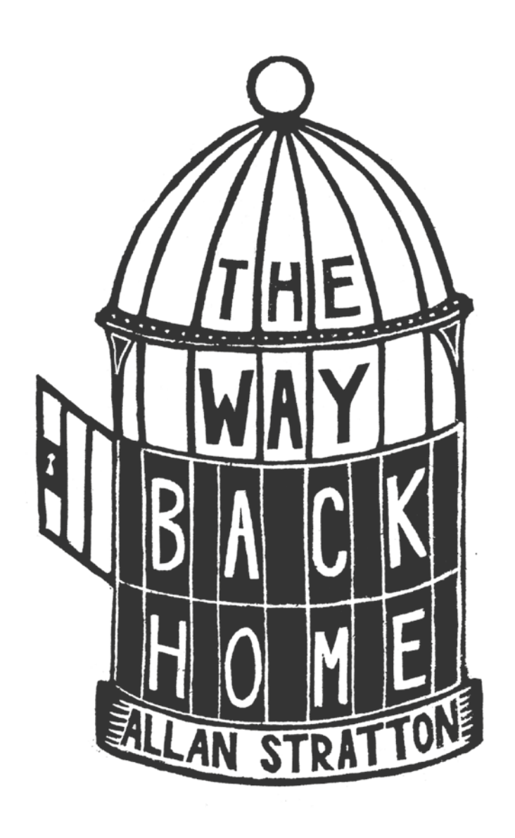
Scholastic Canada Ltd. Toronto New York London Auckland Sydney Mexico City New Delhi Hong Kong Buenos Aires