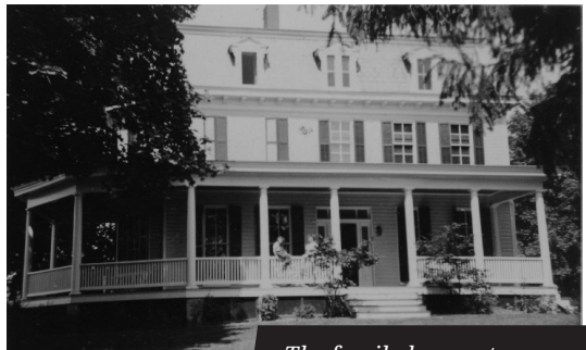
The family home at Box Horn Farm.

In order to satisfy the children's curiosity, the home's library was filled with books. The farm had over one hundred acres and was looked