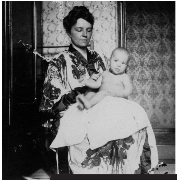
Baby Virginia in her mother's lap.