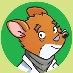
Paws von Volt

BuggyWugsy is Benjamin's best friend, a cheerful and lively little rodent. Sometimes she can be a bit too lively, but I must confess she is irresistibly sweet!