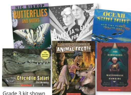
Grade 3 kit shown