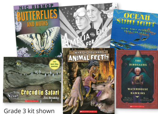
Grade 3 kit shown