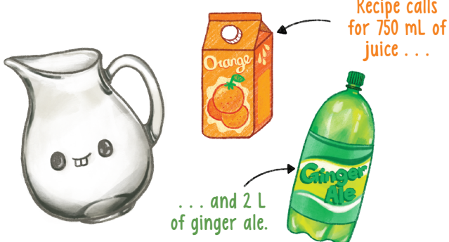
Step 1: First, pick the unit you want everything to be measured in. Let's go with litres because that's the capacity of the pitcher. The ginger ale is already in litres, so cool. You need to figure out how many litres the juice is, so that you can calculate the amount of fruit punch in the same units.

All you have to do is add the volumes of the liquids together and compare that to the volume the pitcher holds. But WAIT! You need to make sure all of our units are the same before comparing or calculating them. Recipe calls for 750 mL of juice . . .