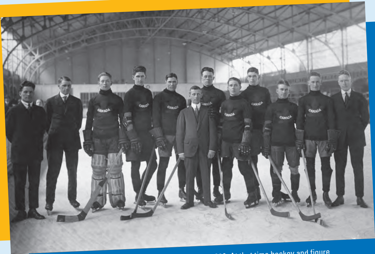
The Winnipeg Falcons' gold-medal Olympic Team in 1920. At that time hockey and figure skating were part of the Summer Olympic Games.

For years, hockey at the Olympics was only for amateur players. A few professionals were allowed to play for the first time at the 1988 Winter Olympics in Calgary. Full participation by NHL players began in 1998 at the Winter Games in Nagano, Japan. Women's hockey also made its Olympic debut in 1998.