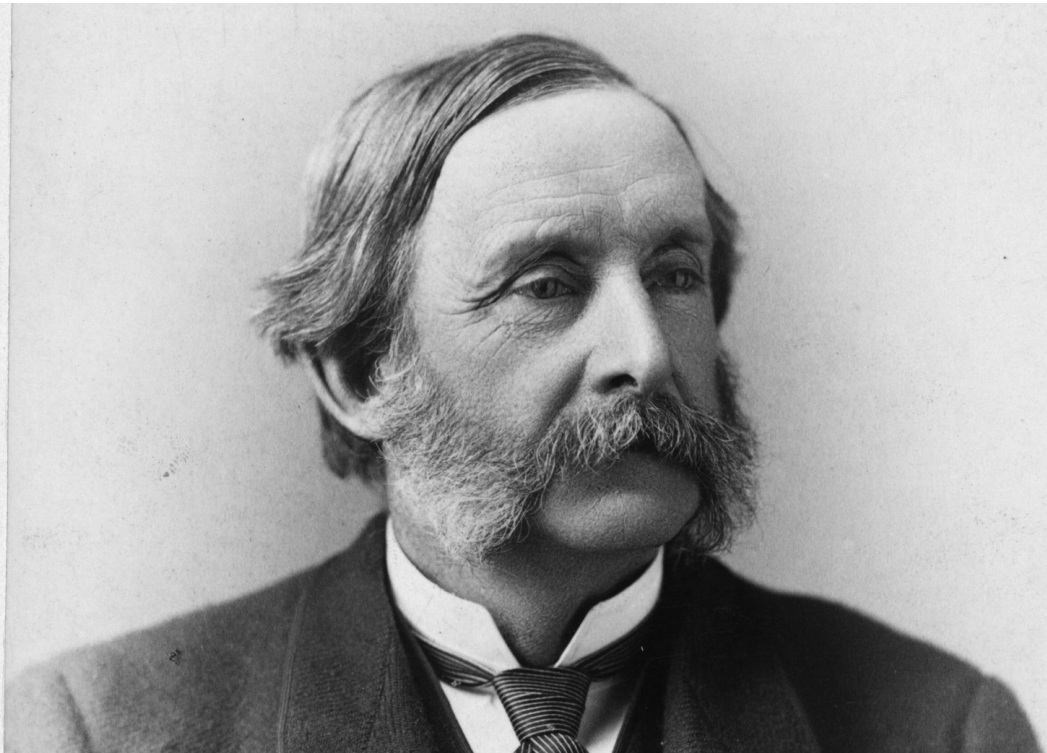
COMMANDER AND ABOLITIONIST: Colonel Thomas Wentworth Higginson's abolitionist activities included involvement with the Underground Railroad.

Land where my fathers died, Land of the pilgrims' pride, From ev'ry mountain side Let freedom ring!