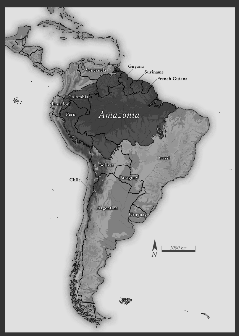
The Amazon, the dark part at the top of the map, covers an area two-thirds the size of the United States.