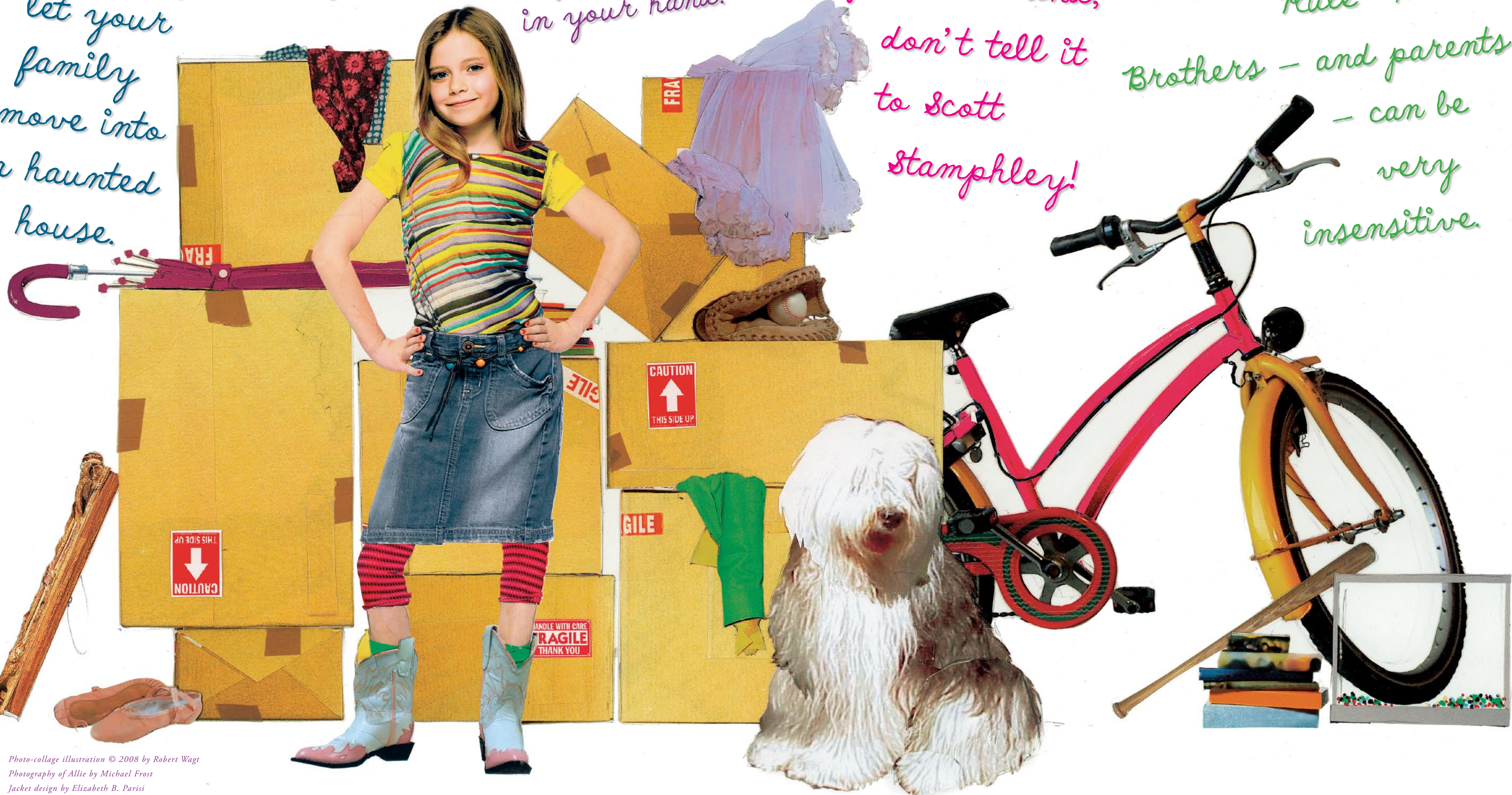
Photo-collage illustration © 2008 by Robert Wage Photography of Allie by Michael Frost Jacket design by Elizabeth B. Parisi

Rule #4: Brothers - and parents - can be very insensitive.