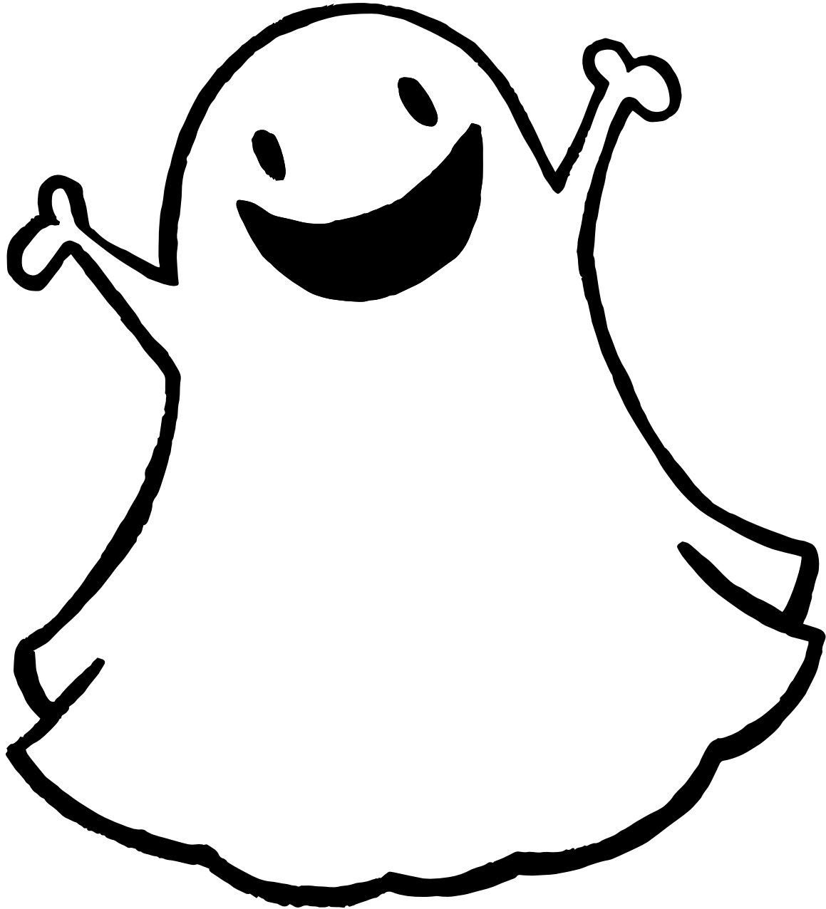
Illustration by Patricia Storms © 2015.

Draw a costume on this ghost so it can go trick-or-treating!