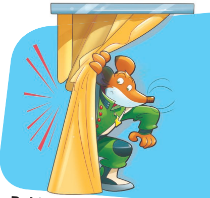
Behind the curtains ...