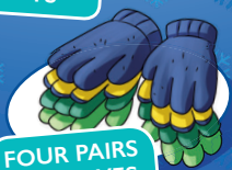
FOUR PAIRS OF GLOVES