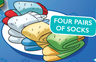
FOUR PAIRS OF SOCKS