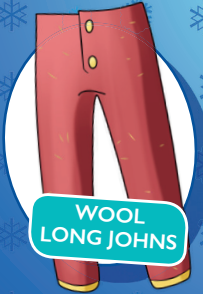
WOOL LONG JOHNS