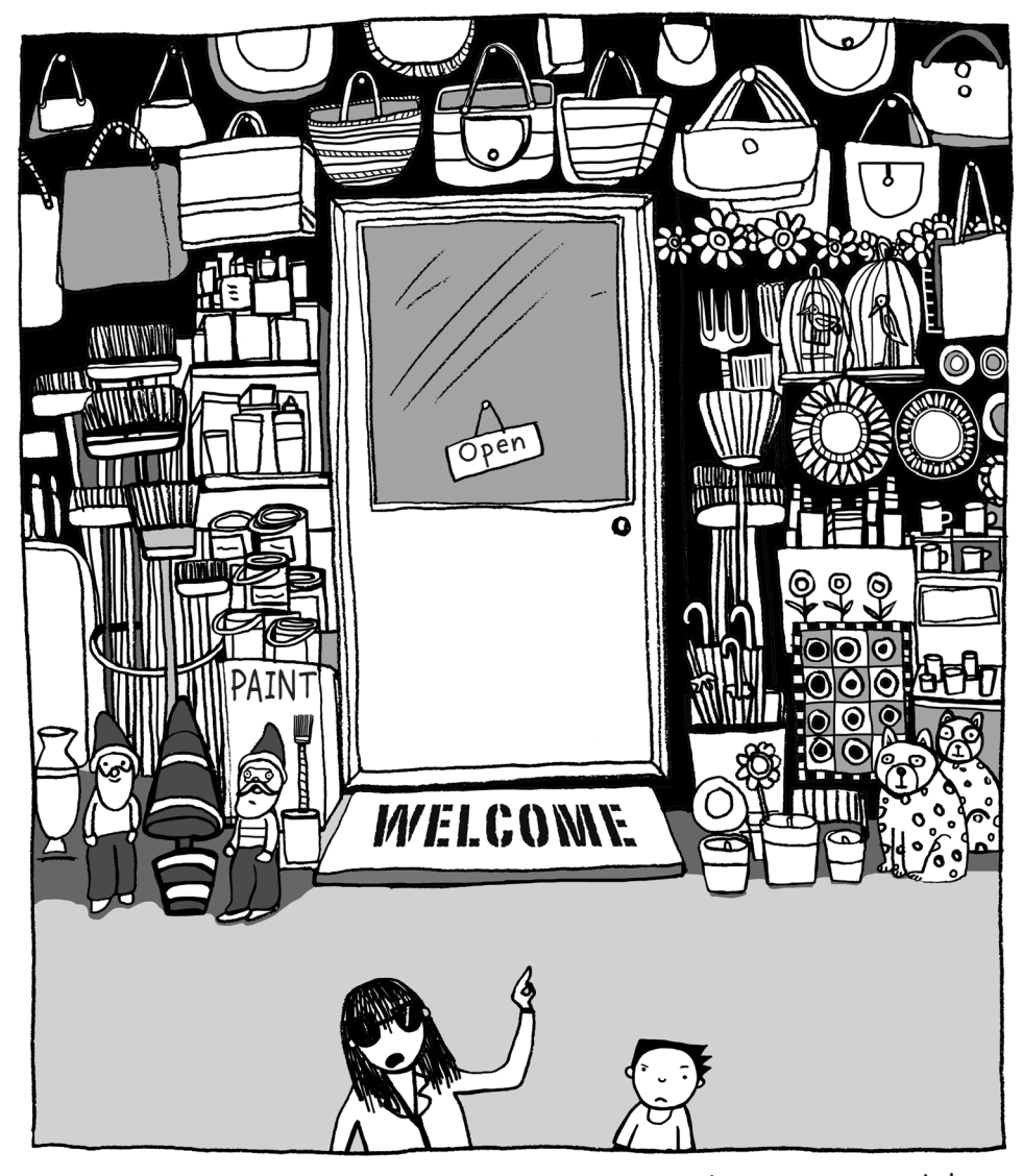
... until we go inside!