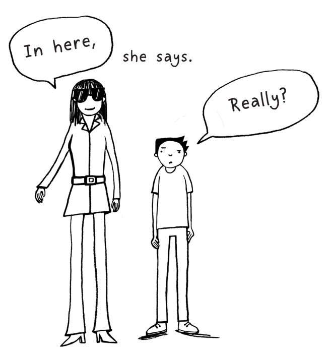
I pull a face at the ODD shop as it doesn't look like a good shop for a present for Leroy ...

Delia stops outside a shop which has ALL kinds of household STUFF hanging up on the walls around the front of the building. There are brooms, pots of paint, plates, bags, umbrellas, funny figures you put in the garden - so many ODD things.