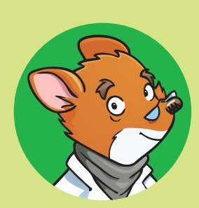
Paws von Volt

Bugsy Wugsy is Benjamin's best friend, a cheerful and lively little rodent. Sometimes she can be a bit too lively, but I must confess she is irresistibly sweet!