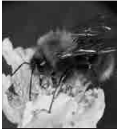
FIGURE 1-6. The tree bumble bee ( Bombus hypnorum ).

The white-tailed bumble bee ( Bombus lucorum ) has the more typical black-and-yellow coloring, with a lemon-yellow "collar" near the top of the thorax and another yellow band across the abdomen. Like the heath and tree bumble bees, it, too, has a white rear end, hence its name. Funnily enough, these