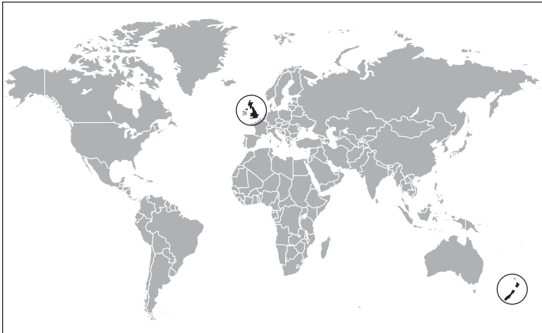
FIGURE 1-8. A map of the world showing where the United Kingdom (UK) and New Zealand are located, in black and circled.

and other species of bumble bees in Iceland were often first discovered near shipping ports or airports. Stowaways on human travel, perhaps?