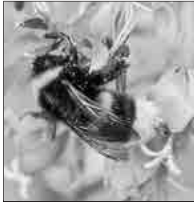
FIGURE 1-10. The buff-tailed bumble bee ( Bombus terrestris ).

from the clover, but they didn't make much of an impact. (We'll learn more about honey bees and solitary bees in