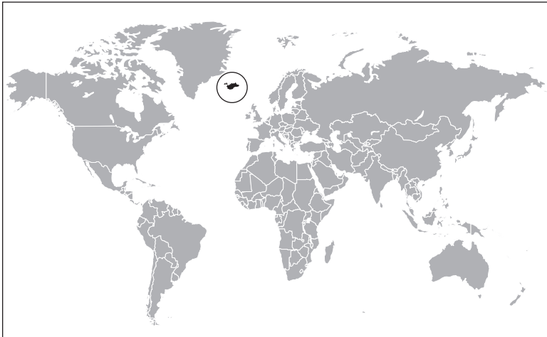
FIGURE 1-5. A map of the world showing where Iceland is located, in black and circled.

bumble bees is dated at about 1640: Writing from that period uses the word hunangsflugur , or honeyflies, which is the traditional Icelandic name for bumble bees. Today it is believed that bumble bees arrived in Iceland by “hitchhiking” on Viking ships, just like the queen bumble bee described earlier. However, there is the possibility that someone back in the days of the Vikings intentionally hid that queen bumble bee among the cargo in order to introduce it to the new land. If they did, they kept poor records of their actions, or they made no records at all.