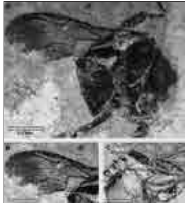
FIGURE 1-1. A fossil of Bombus cerdanyensis , approximately 23 million to 5 million years old, found in Spain.

We haven't actually found a whole lot of bumble bee fossils. But evidence from the few that we have,