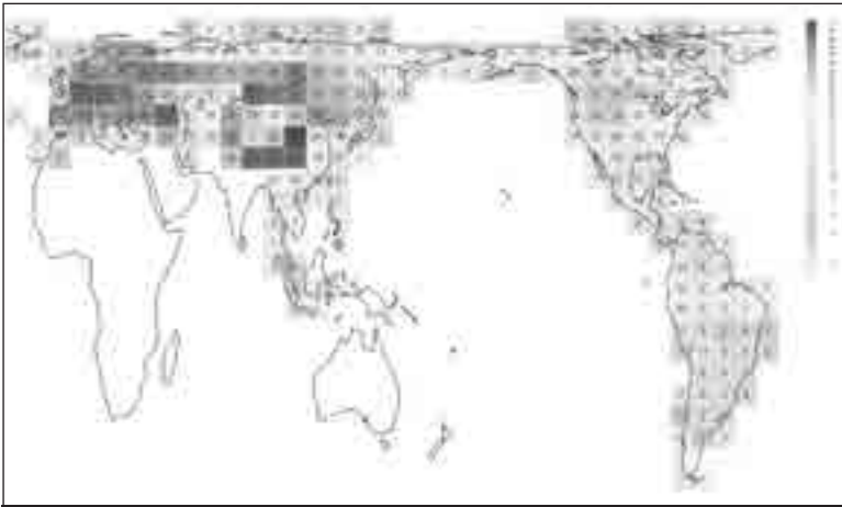
FIGURE 1-3. Where bumble bees are found around the world. Shaded areas are where bumble bees have been found to naturally occur. The number in each cell stands for the number of bumble bee species that have been found in that area. Each grid cell represents an equal area, about 235,908 mi 2 . Darker areas have a greater number of bumble bee species, and lighter areas have fewer bumble bee species. One part of China has the most, with seventy-one.

continent-hopping humans—the spread of bumble bees around the world started to look a bit different. Thanks to human influence, there are now species of bumble bees in places where these species have never been before. And probably never would have been, if it wasn't for our helping hands.