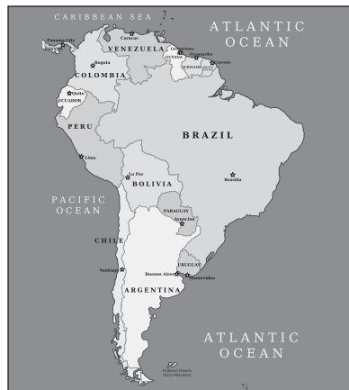
FIGURE 1-11. Map of South America. The country of Chile is found along the lower left-hand side of the continent.