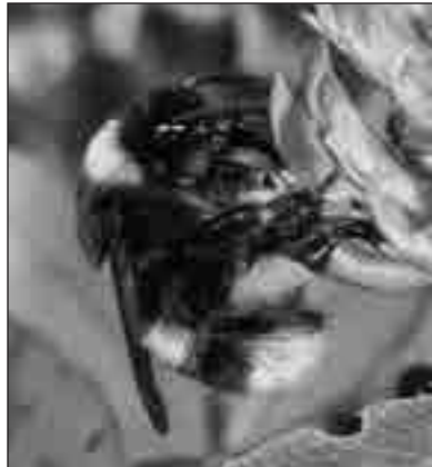
FIGURE 1-7. White-tailed bumble bee ( Bombus lucorum ). This bumble bee has large balls of pollen on her back legs.