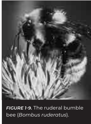
FIGURE 1-9. The ruderal bumble bee ( Bombus ruderatus ).

were released on New Zealand's South Island. This venture was declared a success, and it was repeated shortly after that with another two hundred or so queen bumble bees. Again, not all of the queens survived, but a number of them did manage to fly off into their new New Zealand turf.