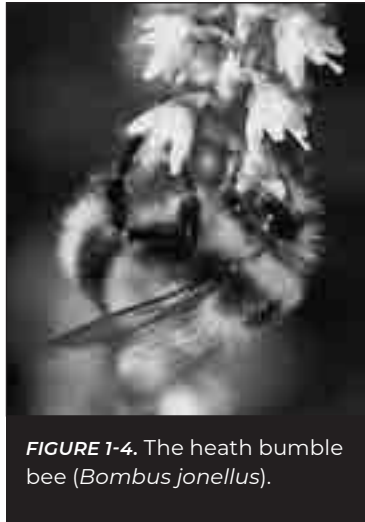
FIGURE 1-4. The heath bumble bee ( Bombus jonellus ).

The earliest Icelandic reference to what were probably