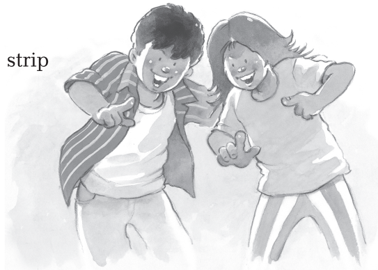
Chart paper Class set of blank comic strips (see reproducible on p. 36)